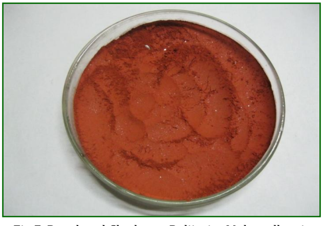
Fig 7. Powdered Shadguna Balijarita Makaradhwaja