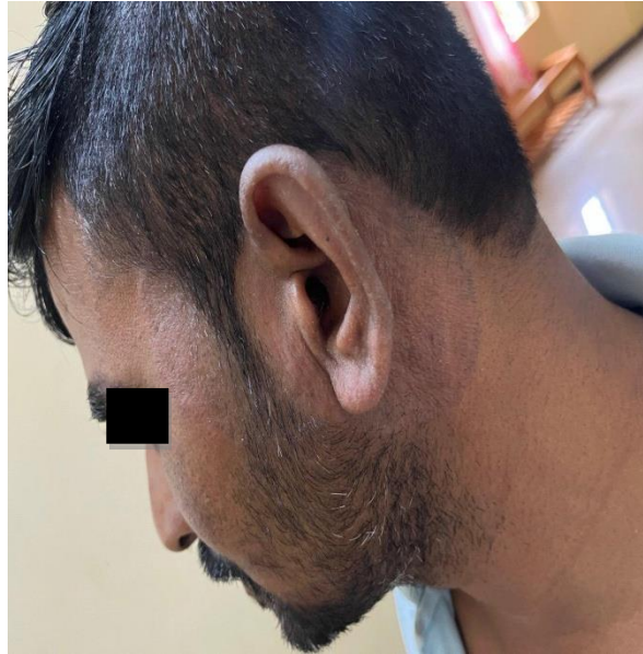
Fig: 2 After Nitya virechana and 1 st follow up