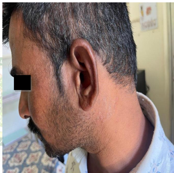
Fig: 3 rd follow up