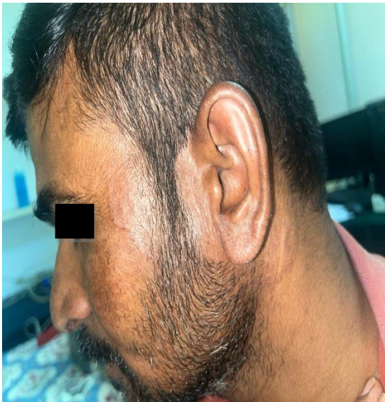
Fig: 2 nd follow up