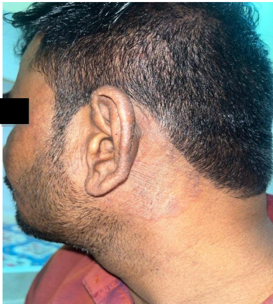
Fig: 1 Before treatment