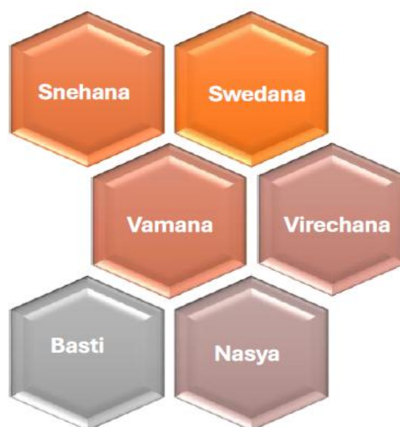
Fig 1.0- Effective Ayurvedic Techniques