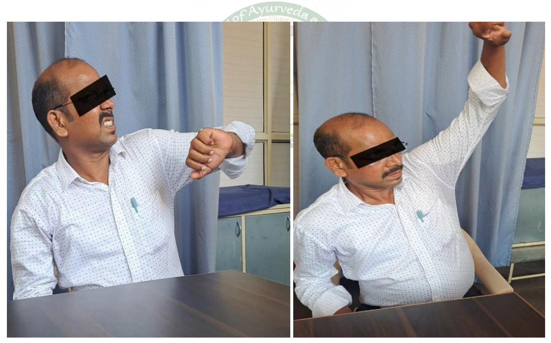
Figure 3: Before Viddha Karma