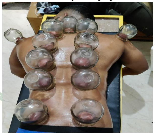
Figure 2: Showing Bloodletting through Cupping Jaloukavacharana [19] (Leech therapy): Leeching is a popular method of bloodletting and widely practiced throughout the world in almost every system of medicine. Many varieties of leeches are available, only non-poisonous medicinal leeches are collected from leech farms. The effected part of the patient is cleaned with lukewarm water. Freshly collected leeches are taken and put into a tray with turmeric and mustard powder. By this process, the leeches become clean and pure. This is done up to 10 minutes, then the leeches become active. Then leeches are transferred to a Kidney tray of clean water. Around one to three leeches are applied to the site of maximum tenderness and the leeches are covered with wet cotton gauze. In the blood sucking process by the leech, water is sprinkled over the gauze piece time to time. Once the bloodletting is done, the leech gets detached from the site. The used leeches are put made to vomit blood with the help of turmeric powder. The wound site is applied with the paste of honey and turmeric powder. After the leeches vomit blood completely, they are transferred to a glass bottle with water.

Ghatiyantra<sup>[18]</sup> (Cupping therapy) - Bloodletting done by the application of glass / small earthen pot is known as Ghatiyantra avacharana (cupping therapy). On the selected area - 3 to 4 pricks are made with the help of sterile needle that leads to a pin point bleeding. The Ghati yantra is wiped from inside with spirit gauge and heated with match stick which was then quickly placed on the bleeding points. As, it was flamed inside, it creates a vacuum because of the consumption of oxygen by the flame which raises the local area to form a bulge and blood oozes out. Same position is maintained till the flow of blood stops and the blood gets clot, after which the Ghati yantra is removed and the area is cleaned with a piece of gauge.