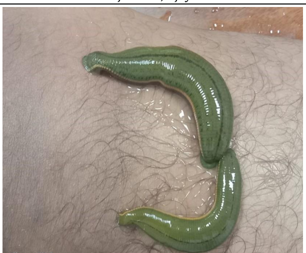
Figure 3: Showing Bloodletting through Leech therapy

Suchivyadhana (Needle puncture): This is a unique technique of bloodletting. References are found in Tibetan and Traditional Bhutanese medicine of the use of Golden needles.<sup>[20]</sup> Presently for the collection of medial collateral ligament tightness in the Varus knee. According to the site of puncture different gauze of needles are used. In Charak Samhita, the same is indicated for treating gouty arthritis<sup>[21]</sup>.