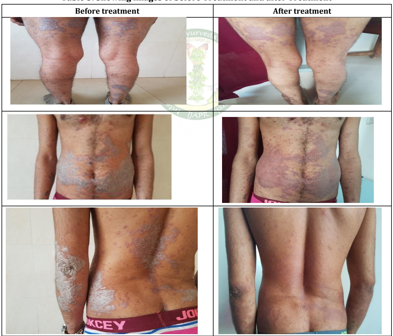
Table 5: Showing images of before Treatment and after Treatment